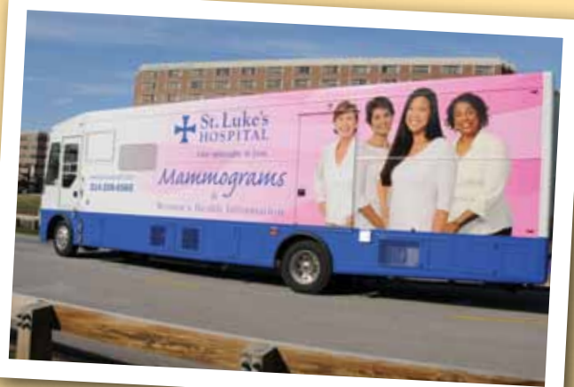
New mobile mammography van