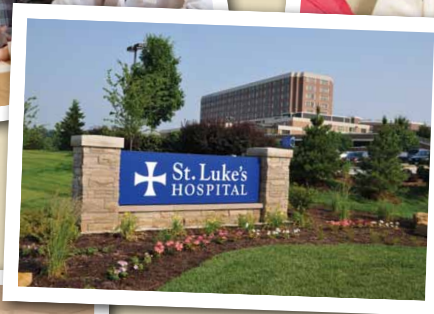
St. Luke's Hospital campus