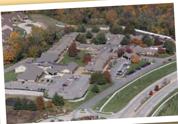
Campus of St. Luke's Surrey Place and St. Luke's Rehabilitation Hospital