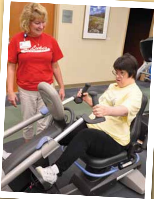
Exercise classes are offered for clients of the Albert Pujols Wellness Center for Adults with Down Syndrome