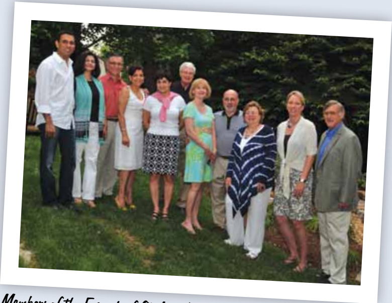
Members of the Friends of St. Luke's connect with St. Luke's through special member events, a speaker series and fundraising efforts

Gifts from the Friends of St. Luke's, which represent annual supporters, raised over $562,000 from 740 donors. Of that, more than $493,000 came from 159 St. Luke's Society members who gave $1,000 or more. Substantial challenge gifts, enthusiastic leadership, the Honor Your Physician tribute program and visibility through the Friends of St. Luke's Living Well Speakers Series contributed to this success.