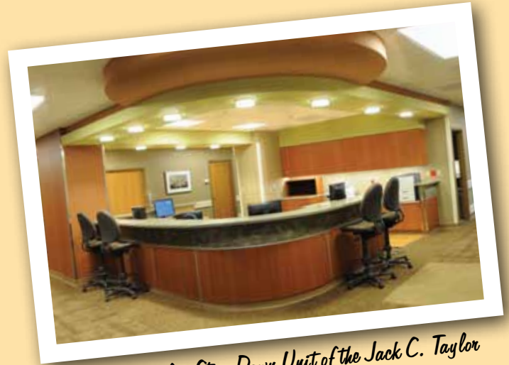
New Cardiovascular Step-Down Unit of the Jack C. Taylor Heart Hospital

St. Luke's Physician Referral Service gives patients direct access to over 1,000 doctors in more than 60 specialties. Registered nurses that staff the line answered 27,976 total calls last year, a 5 percent increase over the previous year, providing referrals to physicians and help with appointment scheduling, including same-day appointments when available. The service can be conveniently accessed by phone, online through the St. Luke's website, on site and now through St. Luke's new mobile app.