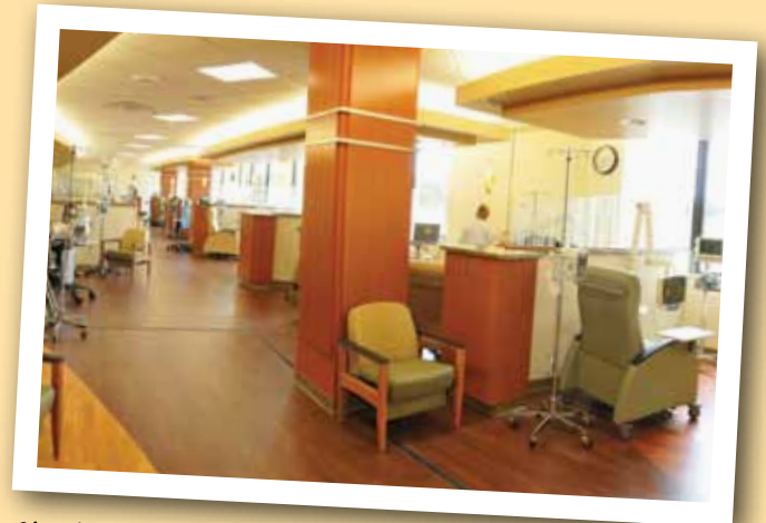
New Infusion Center