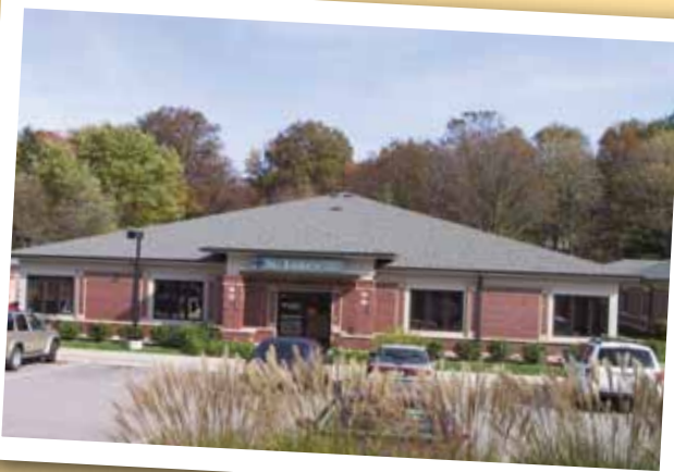
St. Luke's Urgent Care Centers offer quality, convenient care at six locations