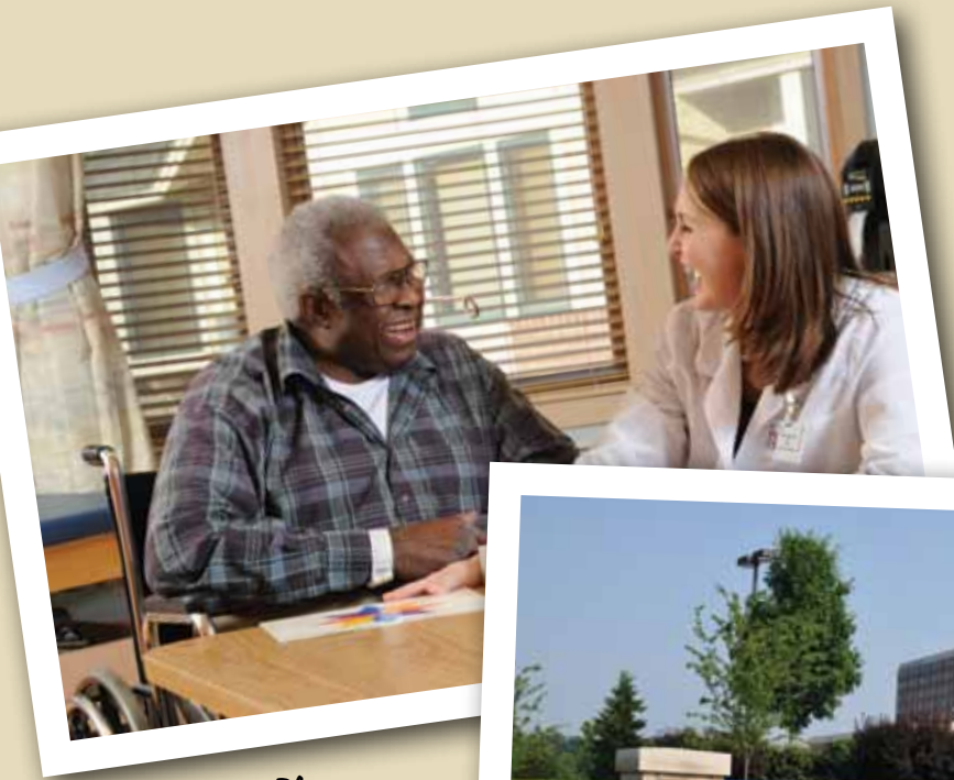
St. Luke's Sweeney Place