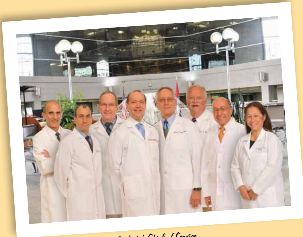
St. Luke's Chiefs of Service