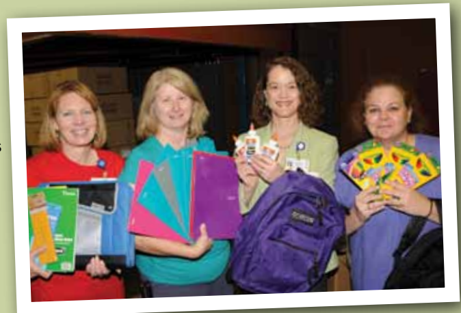
School supplies drive