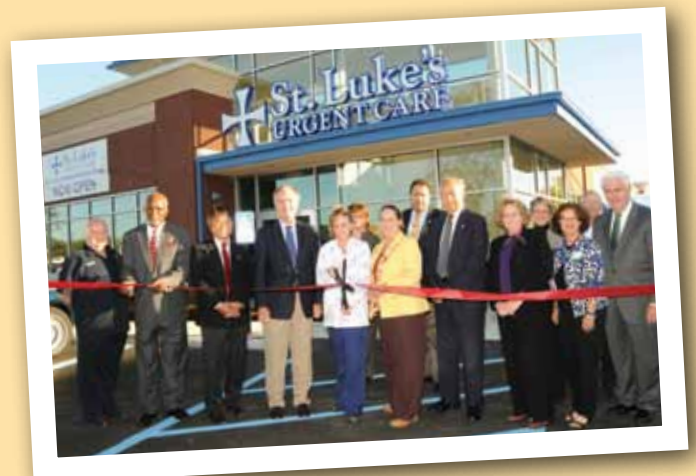
Opening of the St. Luke's Urgent Care Center in Creve Coeur