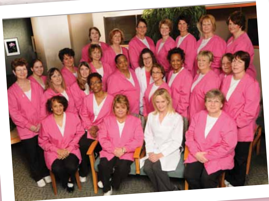
Hospital Mammography Department staff