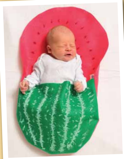
Newborns at St. Luke's are dressed in themed baby bunnings for special photo opportunities