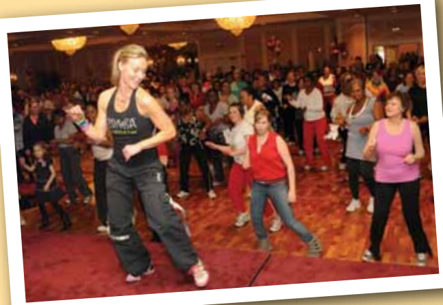
The third annual St. Luke's Hospital Day of Dance