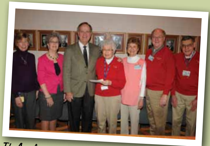
The Auxiliary donated $141,000 to St. Luke's in 2011

Committed to theological and professional education for ministry, St. Luke's Pastoral Care Department also offers a Clinical Pastoral Education program. It provides ministry students of various faith traditions a valuable learning opportunity.