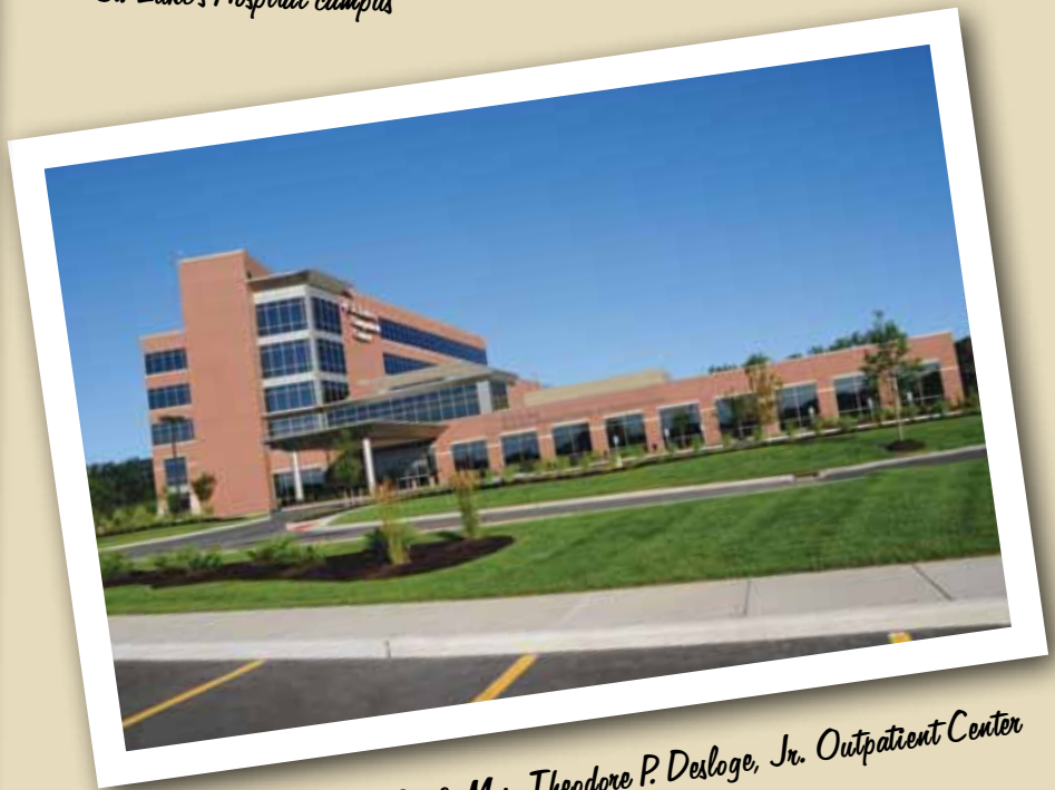
Mr. & Mrs. Theodore P. Desloge, Jr. Outpatient Center