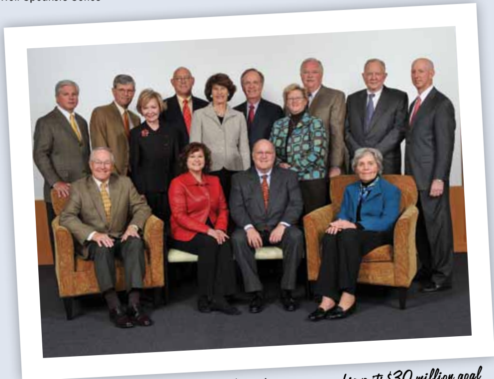
The Executive Campaign Committee helped the campaign achieve its $30 million goal