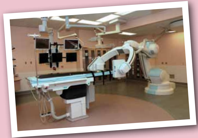
Hybrid operating room

St. Luke's Information Services team developed the app for the Apple® platform, and it is compatible with iPhone®, iPod touch® and iPad™. The app is available for free download from iTunes® or by searching for St. Luke's Hospital on the App Store SM on mobile devices.