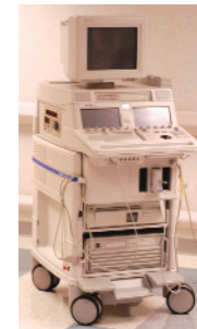
HP Sonos 5500

Some of the monies went toward purchasing a decontamination unit for emergency preparedness and an HP SONOS 5500, a high-performance ultrasound system used for echocardiogram testing in cardiology.