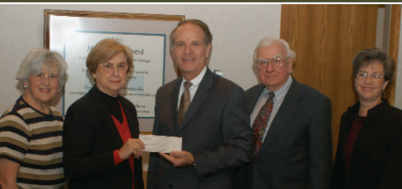
Auxiliary Check Donation Ceremony