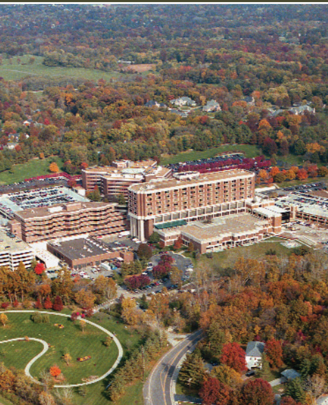
St. Luke's Hospital Campus

St. Luke's Hospital supports physicians' changing technological needs and recruits new physicians so we may continue to offer an expansive array of services and specialties.